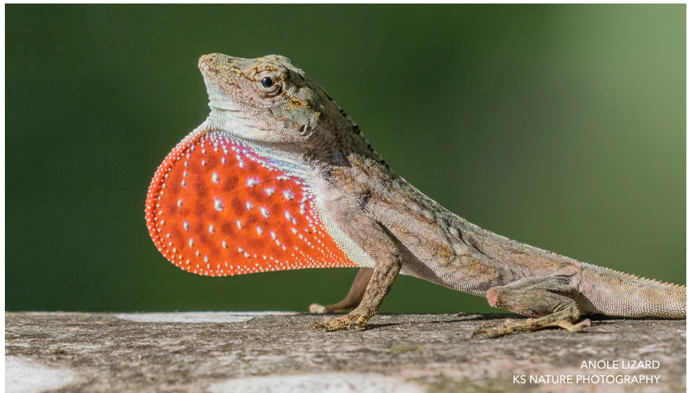
ANOLE LIZARD