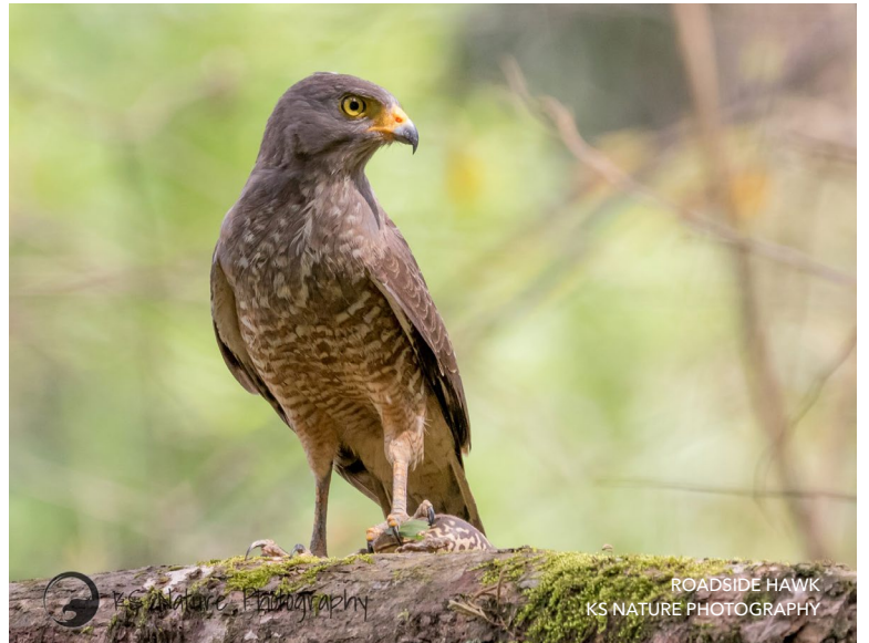
ROADSIDE HAWK KS NATURE PHOTOGRAPHY