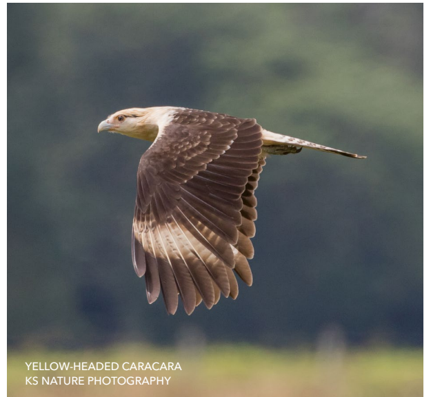
YELLOW-HEADED CARACARA KS NATURE PHOTOGRAPHY