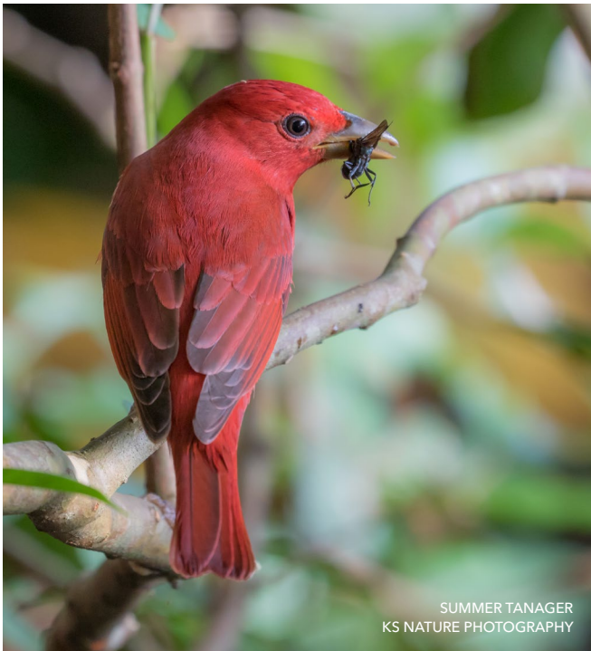
SUMMER TANAGER KS NATURE PHOTOGRAPHY