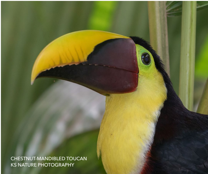
CHESTNUT-MANDIBLED TOUCAN