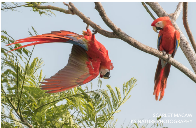
SCARLET MACAW

This morning you will be transferred to the international airport for your flight home. Flights should depart no earlier than 2:00 pm. (B)