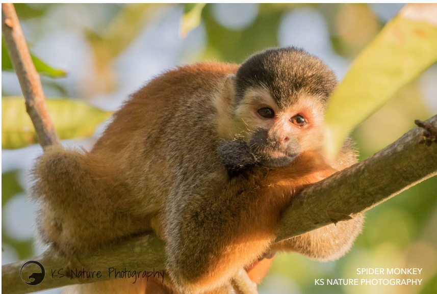
SPIDER MONKEY KS NATURE PHOTOGRAPHY